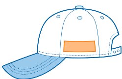
LEFT SIDE 2.5"W x 1"H