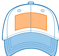
FRONT CENTER 5"W x 2"H