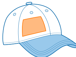
FRONT RIGHT 2.5"W x 2"H