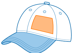
FRONT LEFT 2.5"W x 2"H