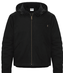
BLACK Black 6C

Textile fabric colours are subject to dye lot variation and will not be exact match to print Pantone reference