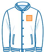
LEFT CHEST 3.5"W x 3.25"H