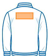
UPPER BACK 14"W x 4"H