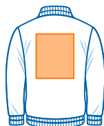
FULL BACK 12"W x 14"H