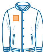
RIGHT CHEST 3.5"W x 3.25"H